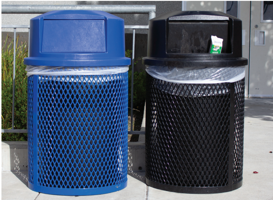
Trash and recycling cans, with milk jug in the trash.

Next time you are heading to class, standing in front of the overfilled bins, take a moment to sort your trash and set a good example. It's time for us, as the student body, to take responsibility for the mess we've made. 🐾