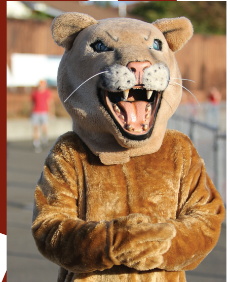
The Cougar poses at football game.