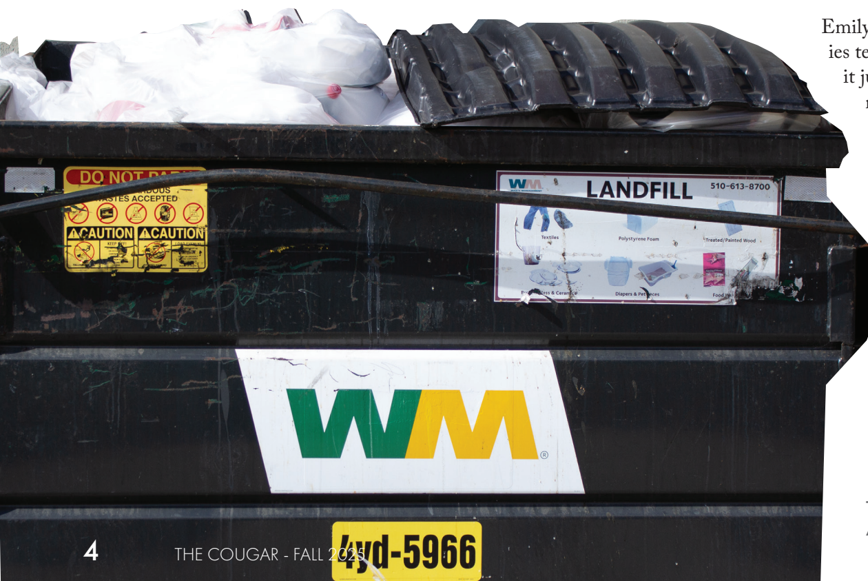
Trash dumpster at AHS behind the gym.

Darren McNally, AHS principal, says, "The custodians will kind of sort it if they can. But the truth is, it's pretty hard, especially with food material, to appro-