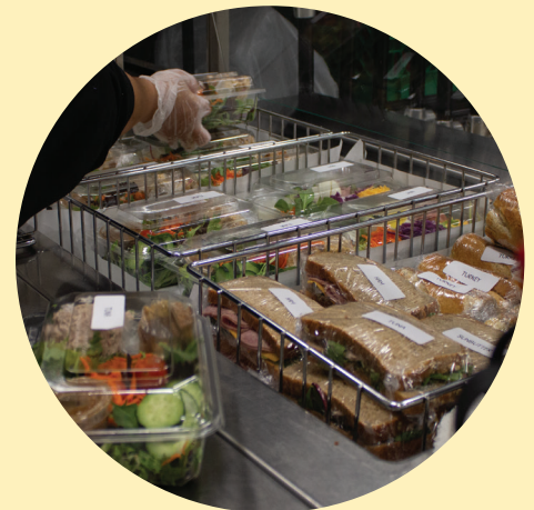
Fresh salads and sandwiches are set out in the lunchroom to be served.